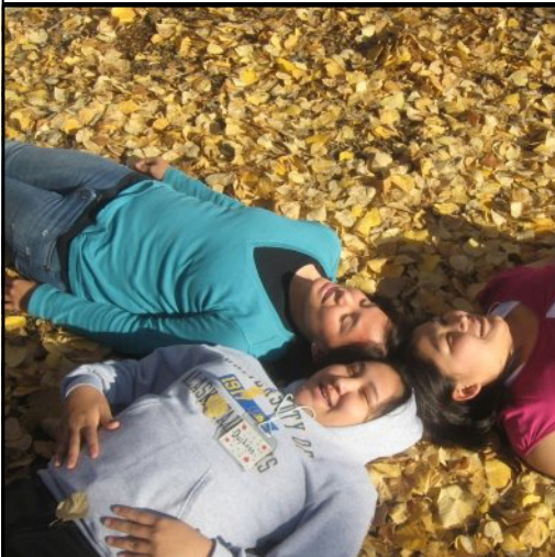
A couple of AEC ladies relaxing during the Covenant Youth of AK Fall retreat.