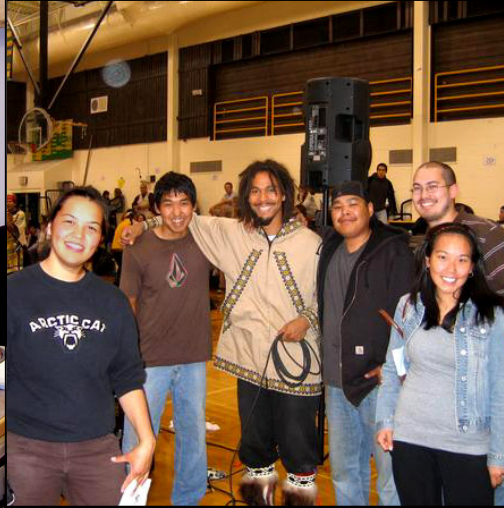
AEC students & the Londons at a Pamyua (Native-funk music) concert.