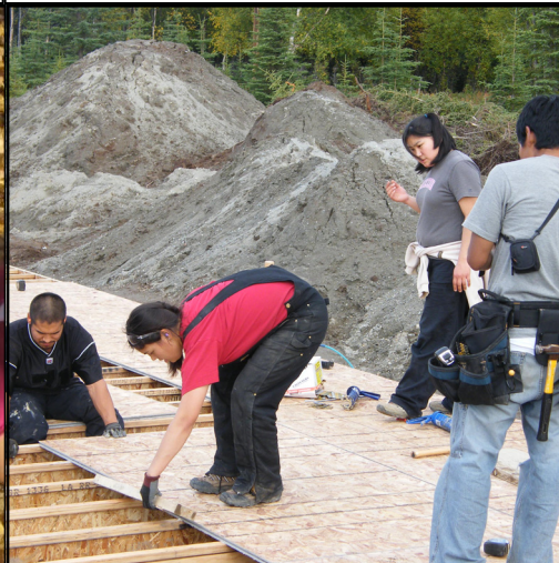
Working hard together to cover the foundation before the snow hits!