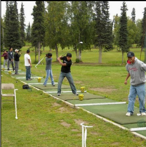
Driving range! Most youth from the village have never even hit a golf ball.