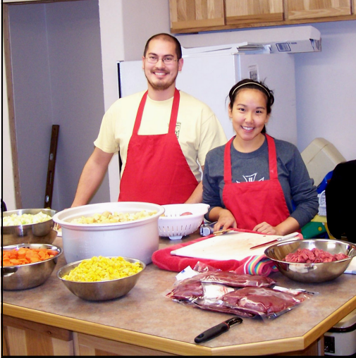
Preparing moose, caribou, and salmon for 100 of our church friends.