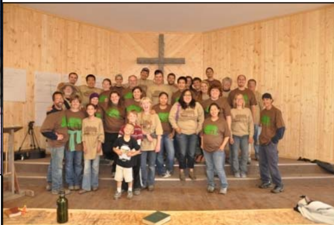
This is the group picture for Vision camp. Vision is the young adult camp that was in early August.