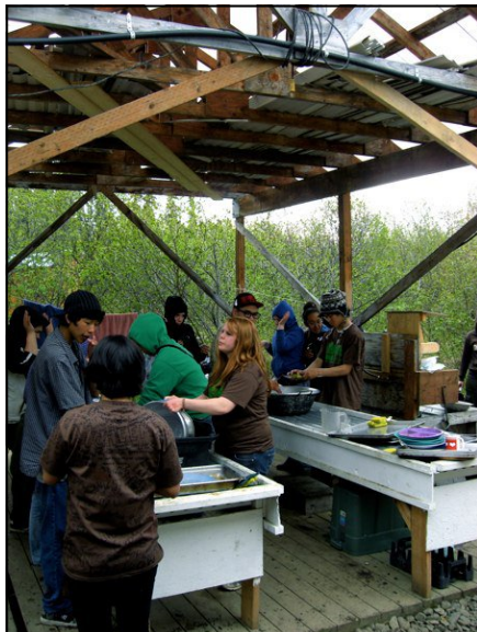
This is the dish washing station at Bible Camp. Each cabin group takes a turn washing dishes after meal time.