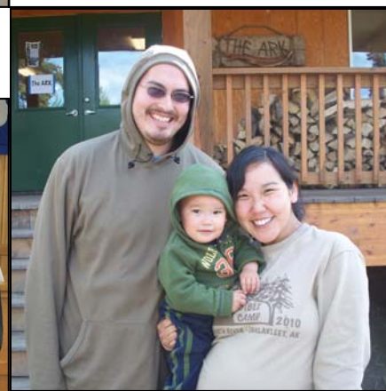
A happy family outside the new temple at camp. The new temple is called "The Ark."