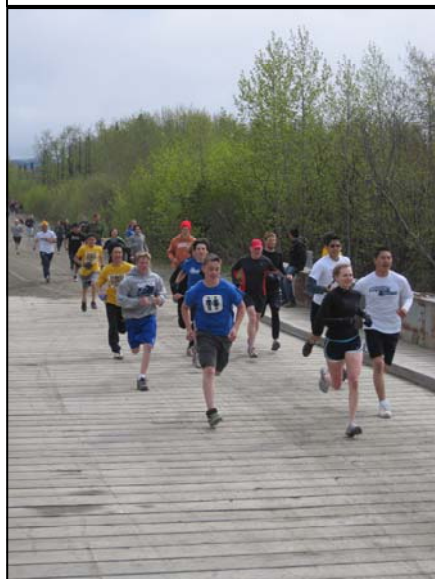
The Musk-Ox Classic! A 5K walk/run that all the High School and Jr. High campers get to run.