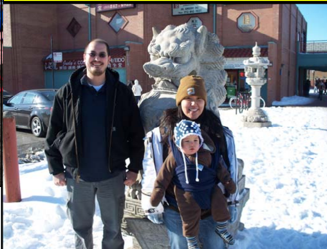
Gong Hei Fat Choy (Happy New Year in Chinese)! We loved going to Chinatown for parades and festivals.