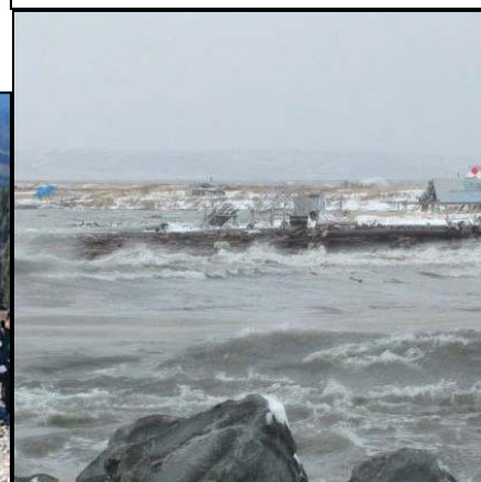
We survived the Super Storm! Thank you to everyone who prayed for safety during November 8-10