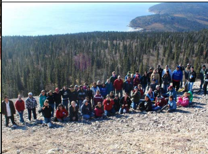
High School Fall Blast in Elim Sept. 20-Oct. 2. Youth from the region traveled to fellowship and hear God's Word.