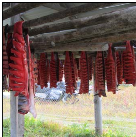
One picture of how God provides bountiful blessings for his people. Drying silver salmon in the fall