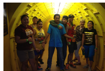
Part of the 27 youth we brought to Tennessee for a national youth gathering.

Quyana, thank you for your generous support of CYAK's ministry. You play an important role in reaching youth and young adults in Alaska with the love of Christ.