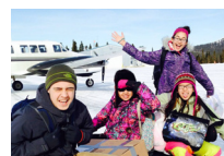
Traveling in style on a homemade sled from the airport to the school on a VBS Mission Trip.