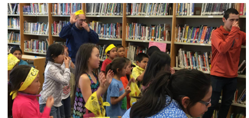
Singing "Who is the King of the Jungle" during one of several VBS Mission Trips last school year.