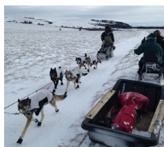
On our way to go ice fishing we had to pull over for an Iditarod dog team to pass by.