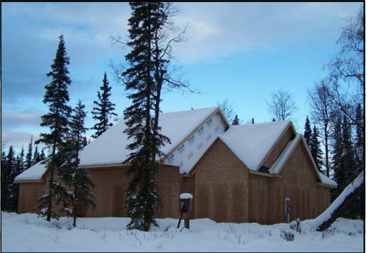
As the students learn to build houses we also seek to build hope in their lives. This is the "House of Hope"