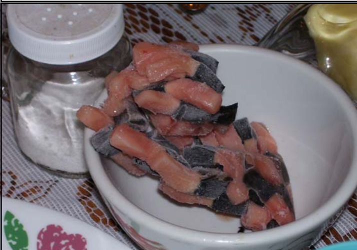
Maktak for the holidays! For those of you that aren't familiar, the black is whale skin and the pink is blubber.