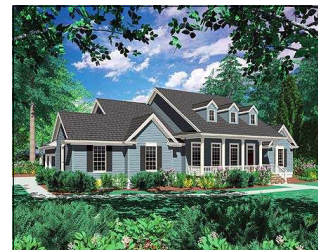
House of Hope '08 (Artist Rendition)

On the heels of this terrific news, we are already in negotiations with potential buyers for the HOH '08. Please pray for the perseverance of our student crew as they seek to complete the home by May and for success in selling the home.