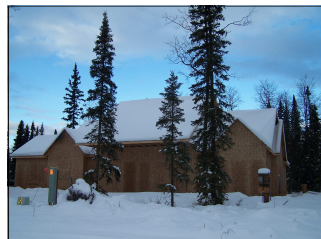
House of Hope '08 Under Construction

It's sold! The House of Hope '07 was sold in January after many months of work invested by students, staff, and volunteers. This is a major answer to prayer and we are thankful to have sold the second student-built home of AEC.